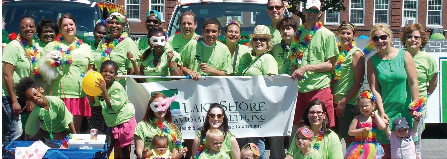
Lake Shore staff members and families participating in recent community event.