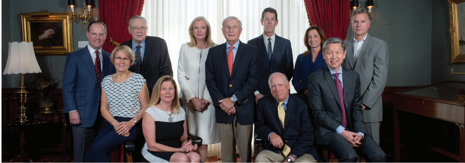
2016 Patrick P. Lee Foundation Board Members