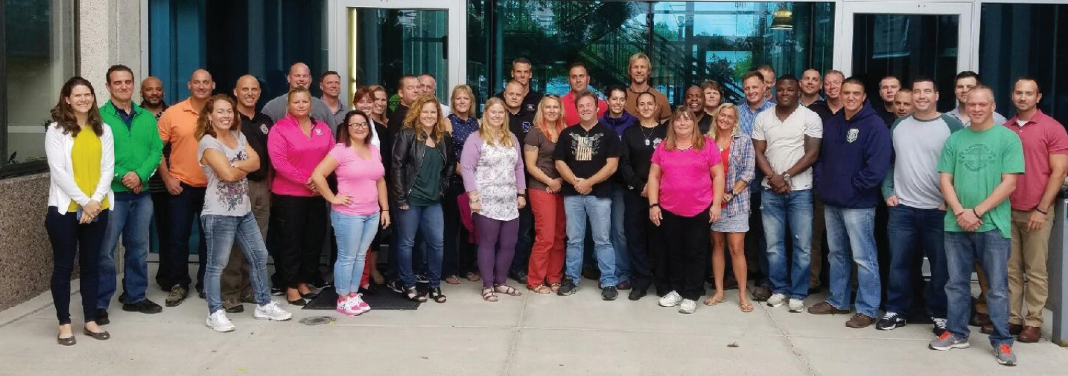
Recent cohort of law enforcement officers after completing CIT Training.